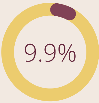
PEOPLE IN THESE CAREERS WITH SOME HIGH SCHOOL EDUCATION