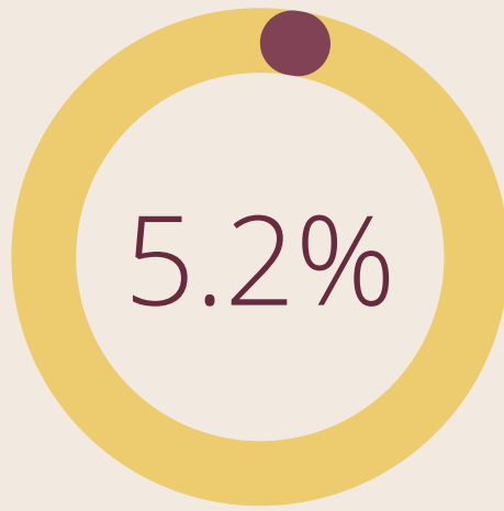
PEOPLE IN THESE CAREERS WITH FOUR-YEAR DEGREES OR HIGHER

STUDENTS ENTER PROGRAMS FOR AUTOMOTIVE TECHNOLOGY, DIESEL MECHANICS TECHNOLOGY, OR AUTO BODY AND COLLISION TECHNOLOGY